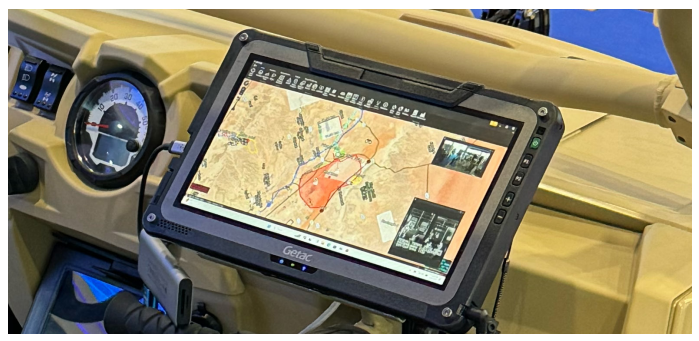
Mission Management Interface

live video feeds, personnel tracking, image sharing, site surveys, augmented reality, geospatial mapping, navigation & chat.